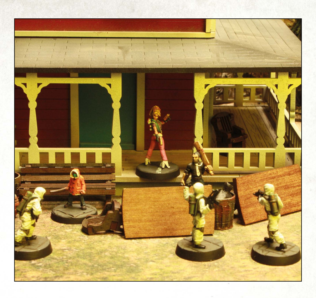
STEP 3: THE REFUGE

Stumbling upon a safe place to hide can often pre-occupy a Group and once they've secured a location sufficiently, they may opt to stay in one place instead of attempting to find a more suitable location. After the Leader has been determined and their Equipment generated, the Refuge must be determined. This will dictate how many Characters are able to join the Leader from then-on as their Max Group Size will need to be respected.